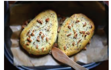
Varškės sūris - made from pressed curd cheese