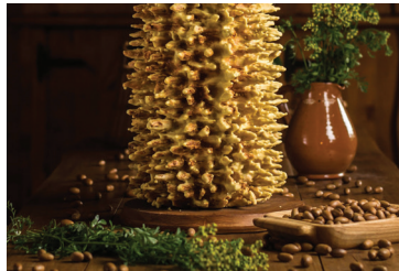
Šakotis ("tree cake") - a traditional spit cake