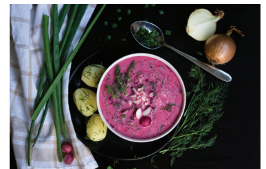
Šaltibarščiai - cold beetroot soup with potatoes on a side. Super refreshing during hot days.