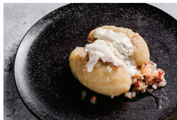
Cepelinai - mashed boiled potatoes with some meat inside, sour cream and extra carbonara on top. Heavy.